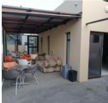
Khanyisela College façade

We have worked with companies who trust our venues' capacity and keep coming back. This is because of our exceptional reputation and warmth that our accommodating staff portrays.