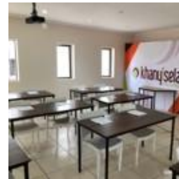
Khanyisela College classroom

Our professional yet charming premises are centrally located in Newton Park, making it easily accessible to the public.