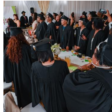
80% of learners attended graduation

"I'm so proud of myself! I can't believe I did it."