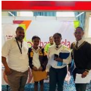
The team and some of the attendees

People who visited our stall took an interest in our exhibition as these were mostly young people who would like to make an impact on the growth of the economy one day.