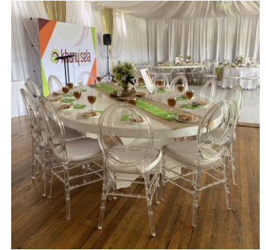
Beautiful graduation venue

Khanjisela College has offered two of these graduates employment from next month.